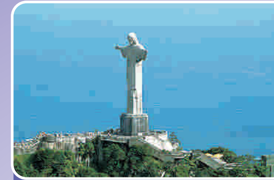
Christ Redeemer (1931) Rio de Janeiro, Brazil