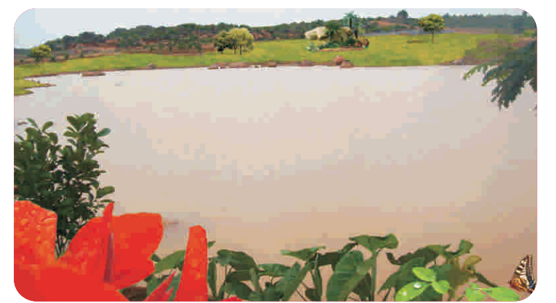
2 acres Natural Lake