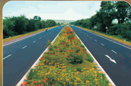
60' and 40' wide BT Roads