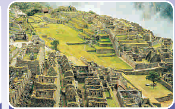
Machu Picchu (1460-1470), Peru