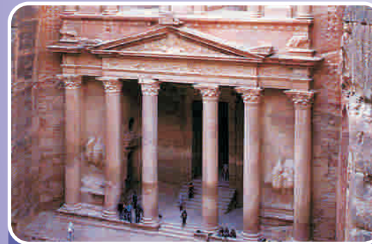
Petra (9 B.C. – 40 A.D.), Jordan