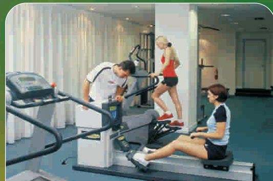
Ultra Modern GYM