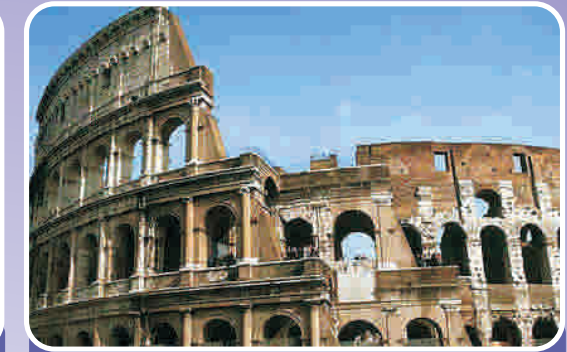
The Roman Colosseum (70 – 82 A.D.) Rome, Italy