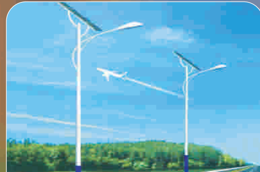
Avenue Lighting and Plantation