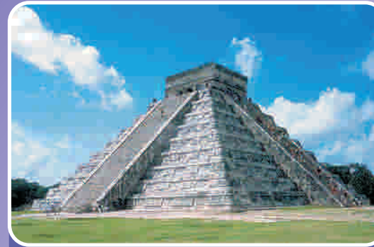
The Pyramid at Chichén Itzá (before 800 A.D.) Yucatan Peninsula, Mexico