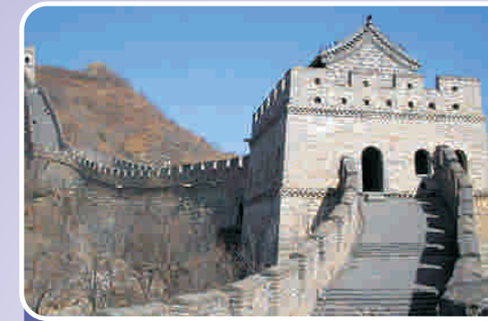
The Great Wall of China (220 B.C and 1368 – 1644 A.D.) China