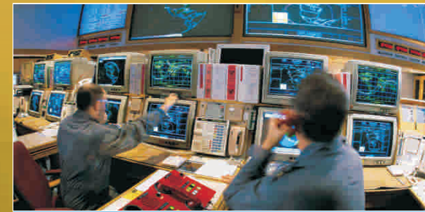
Research & Development Centre