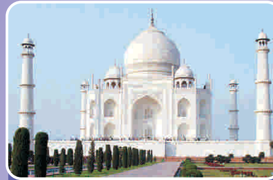
The Taj Mahal (1630 A.D.) Agra, India